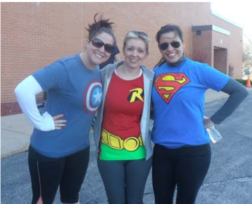
Our teachers are superheroes!

In addition to the School Uniform Dress Requirement, students are NEVER to wear any of the following at school or school-related functions: hats, sweatbands, head scarves, outdoor coats or jackets, gloves, other forms of outdoor apparel inside school buildings; spandex,