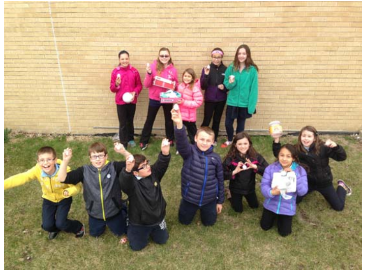
McCord students conduct science experiments during the after school enrichment program.

School residency verification is required annually. A registration and residency verification packet for student enrollment is available at every school. The Board of Education has authorized the administration to employ the services of a private investigator for purposes of verifying residency. Questions about legal custody and residency requirements can be directed to the Assistant Superintendent for Student Services at 708-496-0500.