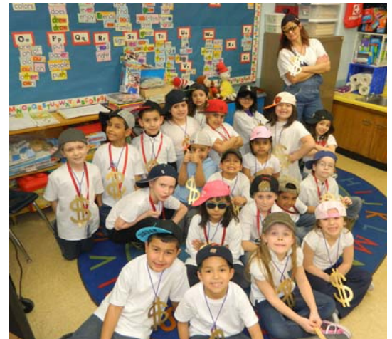
Burbank students participate in a rap contest in honor of Luther Burbank's Birthday on March 28.

Students with a fever or vomiting should not attend school. Children should be without a fever or vomiting for 24 hours before returning to school. Any student with an undiagnosed rash or communicable disease must have a note from his/her physician releasing him/her to return to school. Any student absent for five or more consecutive school days must provide a note from his/her physician.