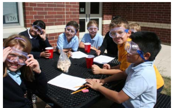
Tobin students conduct science experiments in the courtyard.

Please remember to make appointments early. Physical, Dental, Sports Physicals, and Immunization forms are available at: www.bsd111.org (click: District Info, Student Health Info)