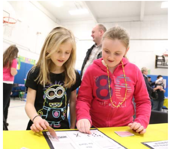
Students and their families participate in activities at Fry School's Family Math Night.

Theme Day On special occasions, as designated by the building principal at his/her discretion, the above uniform dress requirements may be relaxed and students allowed to attend school without complying with the requirements. Examples of such occasions include, but are not limited to the following: School Spirit Day, Costume Day, other themes determined by the building principal; District 111 Band Uniform, when designated by the band director(s) and approved by the Building Principal; the uniform of a nationally recognized youth organization, such as Boy or Girl Scouts on scout meeting days.