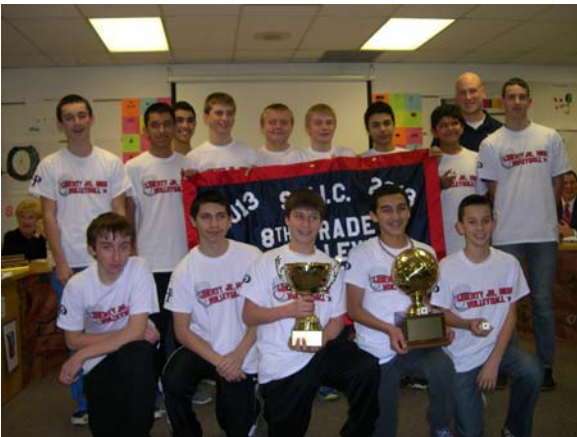
The 8 th Grade Boys Volleyball Team is the first in Liberty's history to win first place for the season and first overall in the tournament.

The fees for the PASS Program are as follows: without bus: $32.00 per week / with bus: $40.00 per week