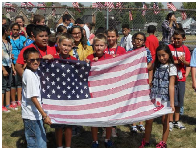
Students hold the American flag during a 9/11 Anniversary Ceremony at Maddock School.