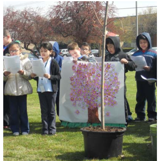
Kennedy students participate in a tree planting ceremony in recognition of Arbor Day.

Applications may be made by a parent/guardian using the appropriate forms available from each school building. These applications should be submitted to the Business Department no later than October 1 or 60 days after a new registration. The Business Department shall review each application received, and shall notify the parent/guardian in writing within ten (10) school days of its receipt whether the request is granted or denied. The Business Department's denial of a waiver request may be appealed to the Superintendent by submitting the appeal in writing to the Superintendent within 14 days of the denial. The Superintendent or designee shall respond within 14 days of the appeal. The Superintendent's decision may be appealed to the Board of Education. The decision of the Board is final and binding. Questions regarding the waiver process should be addressed to the Business Department.